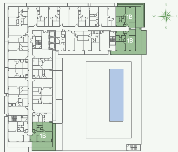
Key Plan of floors 9 & 10.