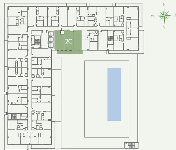
Key Plan of floors 6 & 7.