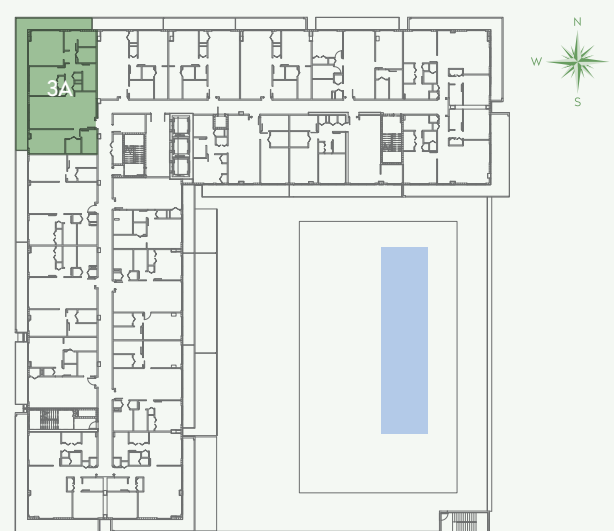
Key Plan of floors 6 & 7.