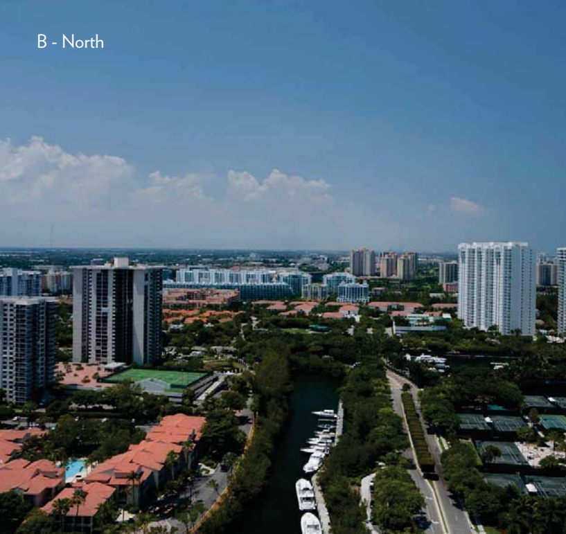
B - North