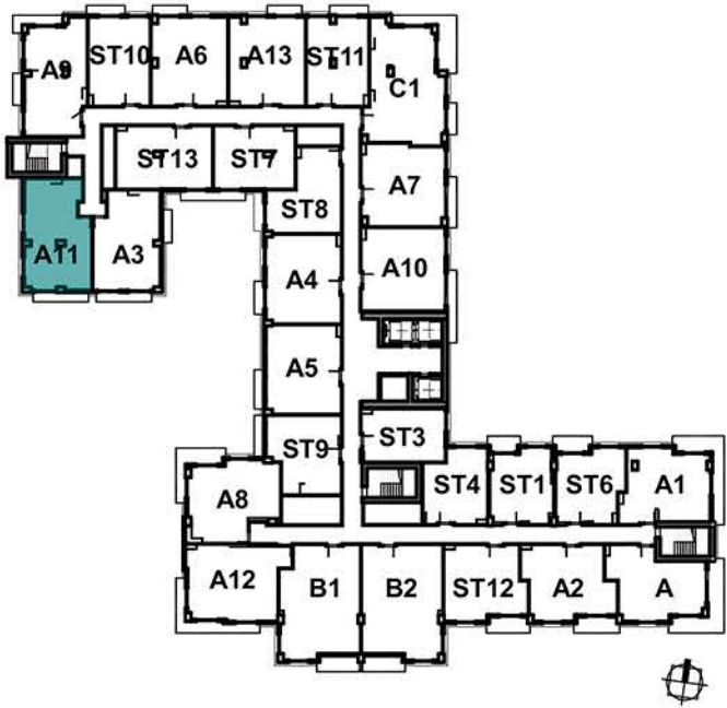
KEY PLAN (LEVEL 7-15)