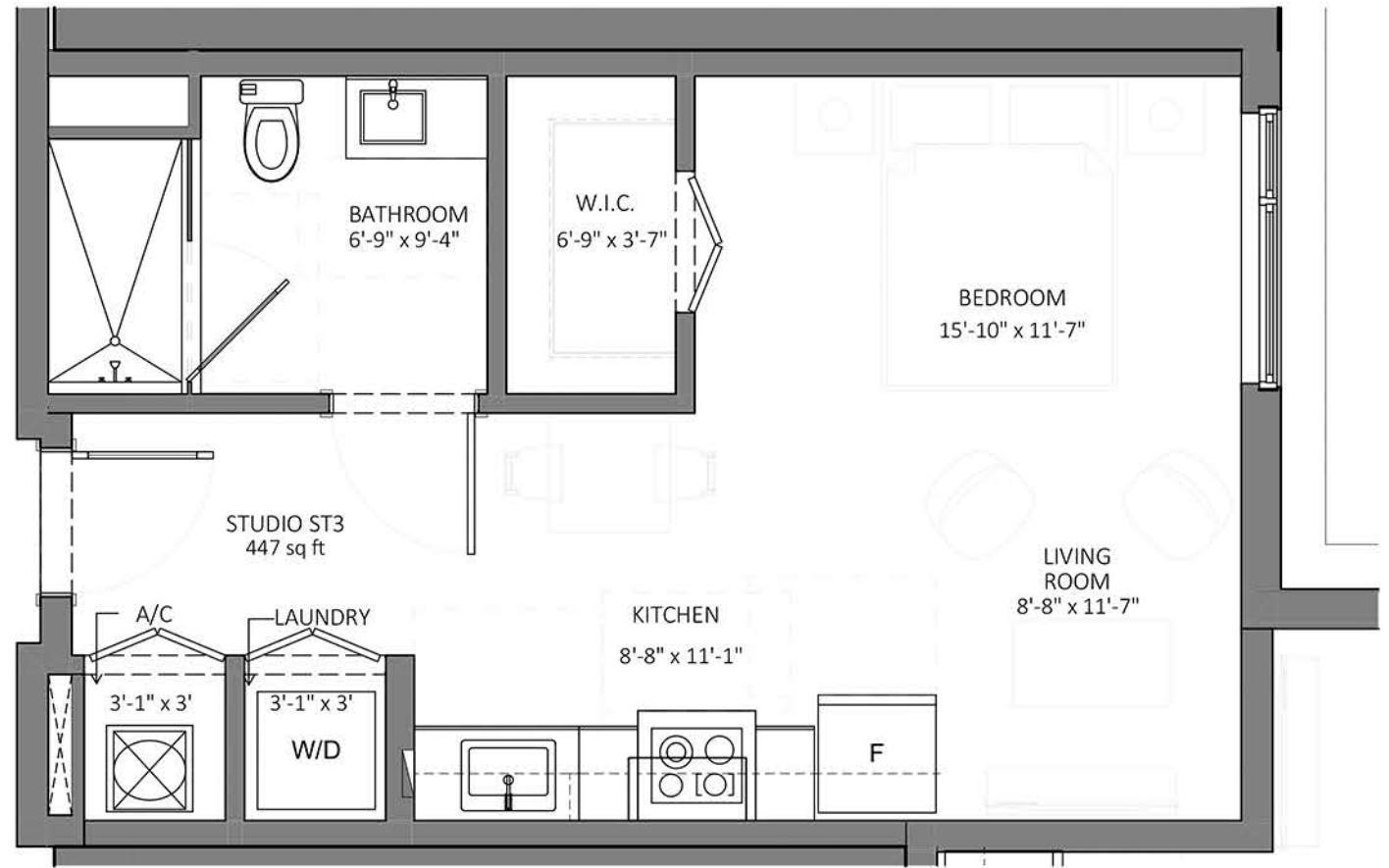
ST3 STUDIO UNIT ST3 SCALE: 1/4" = 1'-0"