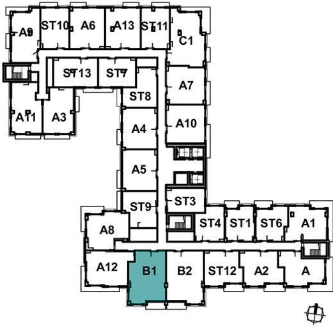
KEY PLAN (LEVEL 7-15)