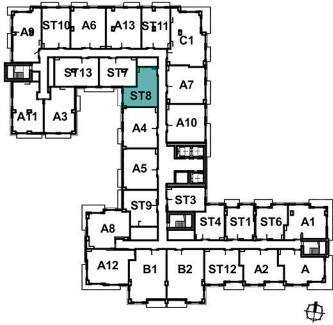
KEY PLAN (LEVEL 7-15)