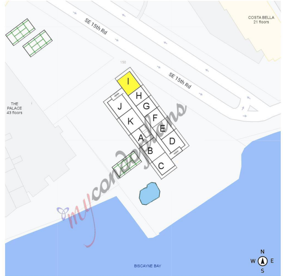
Floor plan may be mirrored, flipped, or not be oriented to site plan