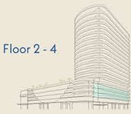
Floor 2 - 4