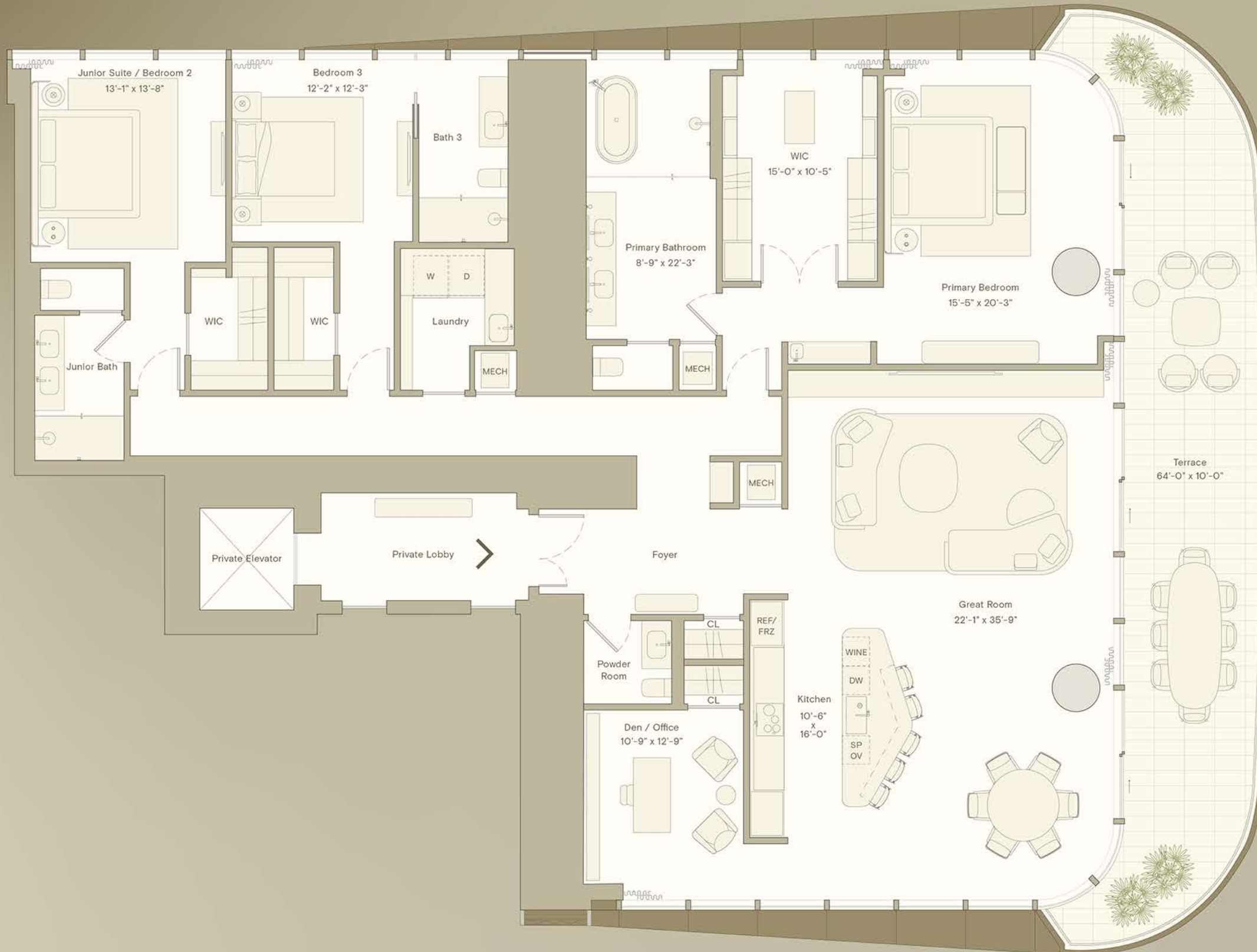
Residence 501-3301 Level 05-33