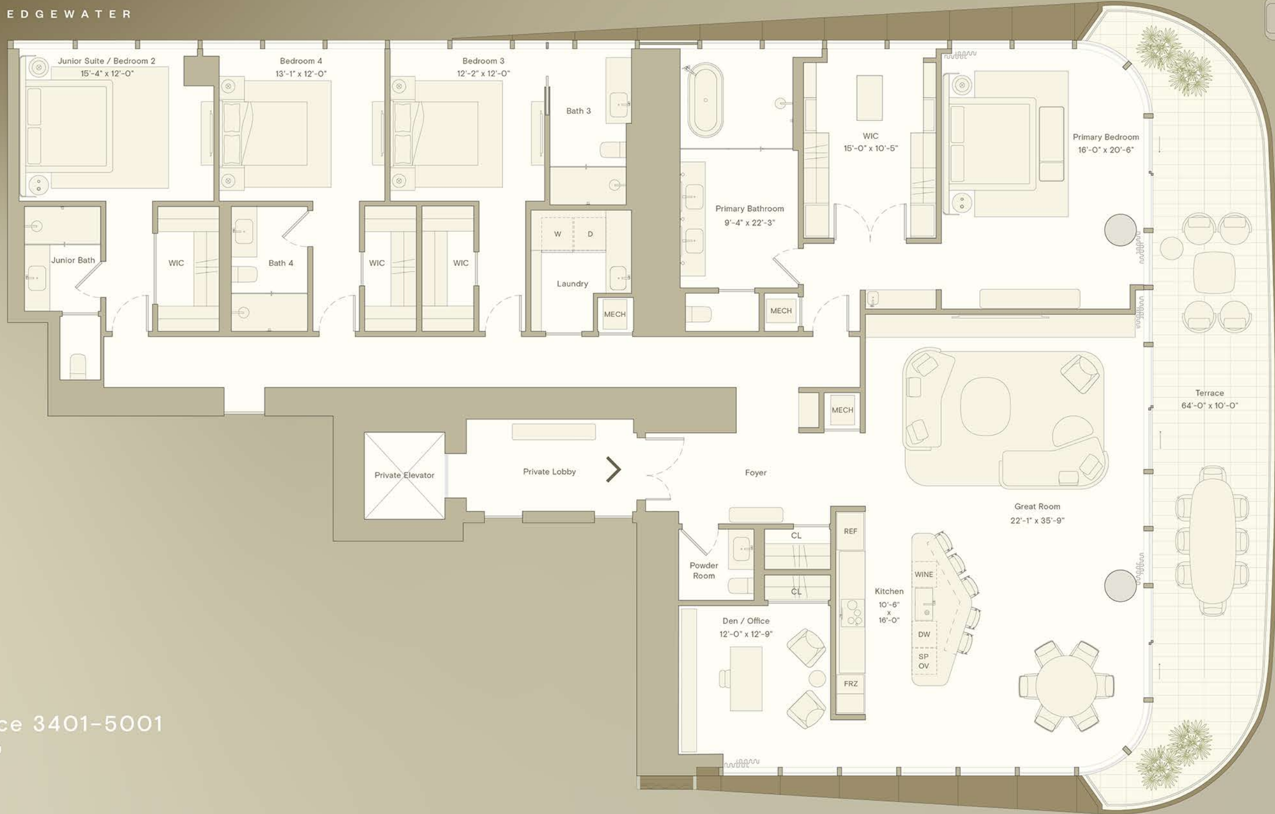
Residence 3401-5001 Level 34-50